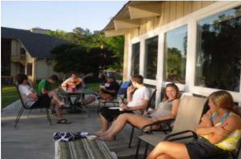
College and Career Lake Party

The mission of St. Peter's School: Entwined by common purpose, the students, teachers, parents, and friends of St. Peter's Episcopal School create an educational environment that nurtures love of learning, joy of service, and a lively faith St. Peter's School is open to three year-olds through fifth grade students. The school's web site is saintpetersschool.net .