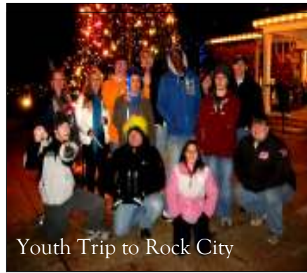
Youth Trip to Rock City